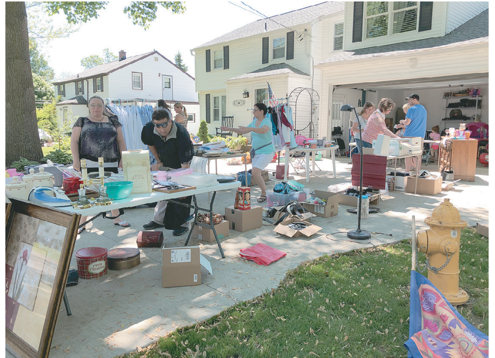
Photos from 10 Mile Garage Sale throughout the previous years